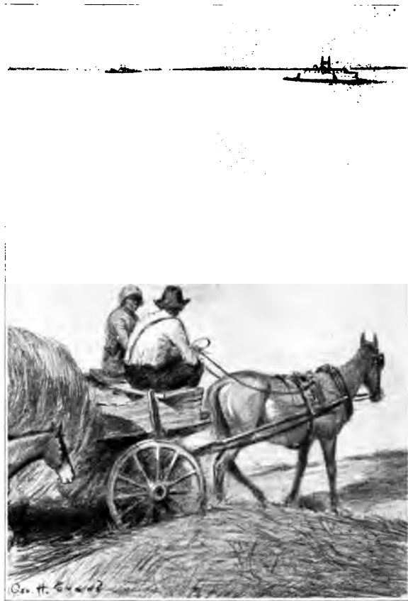
I come ter one pond I couldn't see ercross